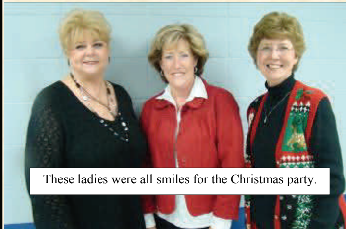
These ladies were all smiles for the Christmas party.