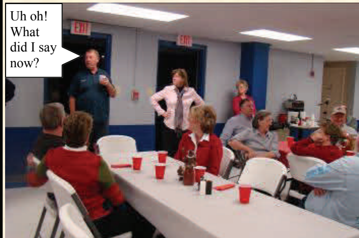
Uh oh! What did I say now?