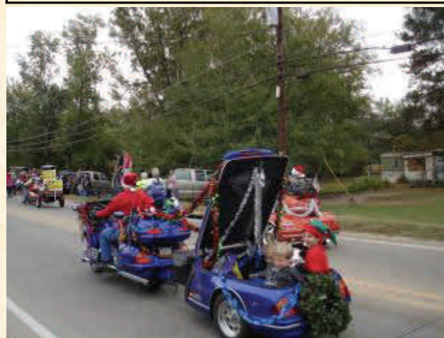
We do not recommend this for a long trip.