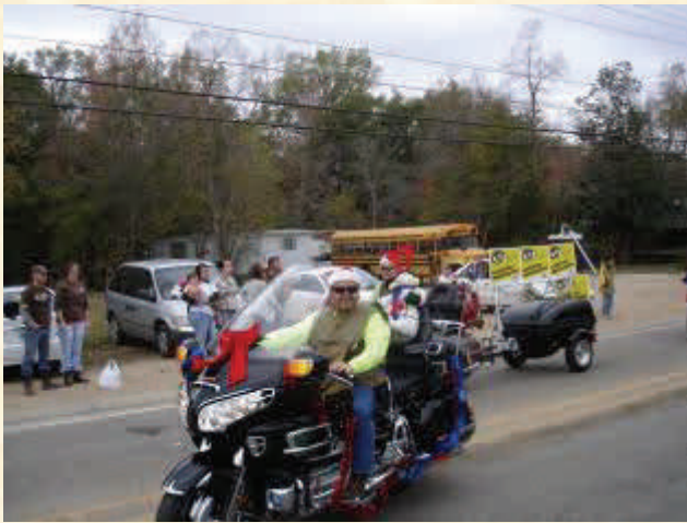
Bo without a co-rider.