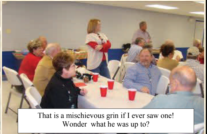
That is a mischievous grin if I ever saw one! Wonder what he was up to?