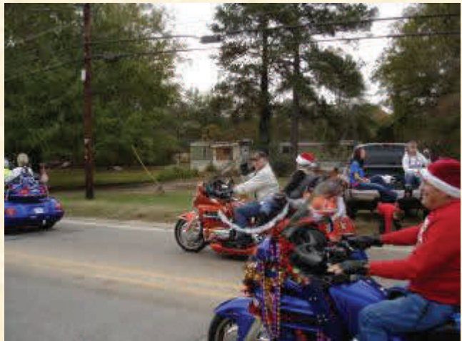
What colorful bikes!